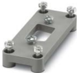
D-SUB adapter plate, for one D-SUB connector, no. of positions 9, housing series HC-D 15...

Please be informed that the data shown in this PDF Document is generated from our Online Catalog. Please find the complete data in the user's documentation. Our General Terms of Use for Downloads are valid ( http://phoenixcontact.com/download )