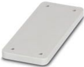
HEAVYCON cover plate, for wall cutouts of type B16, 7 mm thick, gray

Please be informed that the data shown in this PDF Document is generated from our Online Catalog. Please find the complete data in the user's documentation. Our General Terms of Use for Downloads are valid ( http://phoenixcontact.com/download )