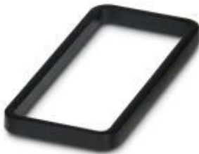
Profile gasket for type B16 supporting base element

Please be informed that the data shown in this PDF Document is generated from our Online Catalog. Please find the complete data in the user's documentation. Our General Terms of Use for Downloads are valid ( http://phoenixcontact.com/download )