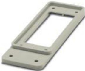
HEAVYCON adapter plate, type B24 on B16, for panel cutouts of type B24, gray

Please be informed that the data shown in this PDF Document is generated from our Online Catalog. Please find the complete data in the user's documentation. Our General Terms of Use for Downloads are valid ( http://phoenixcontact.com/download )