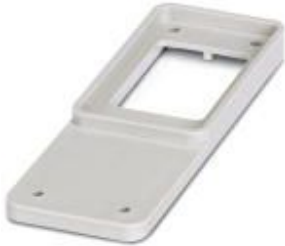
HEAVYCON adapter plate, type B24 on B6, for panel cutouts of type B24, gray

Please be informed that the data shown in this PDF Document is generated from our Online Catalog. Please find the complete data in the user's documentation. Our General Terms of Use for Downloads are valid ( http://phoenixcontact.com/download )