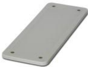
HEAVYCON cover plate, for panel cutouts of type B24/HV16, 3.5 mm thick, gray

Please be informed that the data shown in this PDF Document is generated from our Online Catalog. Please find the complete data in the user's documentation. Our General Terms of Use for Downloads are valid ( http://phoenixcontact.com/download )