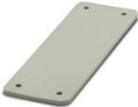
HEAVYCON cover plate, for wall cutouts of type D25, 3.5 mm thick, gray

Please be informed that the data shown in this PDF Document is generated from our Online Catalog. Please find the complete data in the user's documentation. Our General Terms of Use for Downloads are valid ( http://phoenixcontact.com/download )