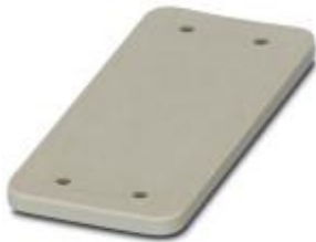
HEAVYCON cover plate, for wall cutouts of type D15, 3.5 mm thick, gray

Please be informed that the data shown in this PDF Document is generated from our Online Catalog. Please find the complete data in the user's documentation. Our General Terms of Use for Downloads are valid ( http://phoenixcontact.com/download )