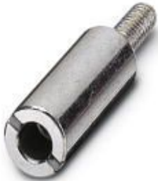
Locking screw barrel, for a firm connection of contact inserts and DIN-rail mountable terminal adapters

Please be informed that the data shown in this PDF Document is generated from our Online Catalog. Please find the complete data in the user's documentation. Our General Terms of Use for Downloads are valid ( http://phoenixcontact.com/download )