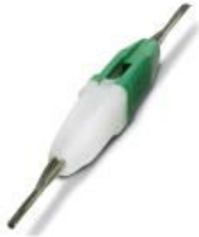
Insertion/extraction tool, to insert and extract the D-SUB high density signal contacts

Please be informed that the data shown in this PDF Document is generated from our Online Catalog. Please find the complete data in the user's documentation. Our General Terms of Use for Downloads are valid ( http://phoenixcontact.com/download )