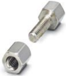
Mounting set, for DSUB gender changer contact inserts

Please be informed that the data shown in this PDF Document is generated from our Online Catalog. Please find the complete data in the user's documentation. Our General Terms of Use for Downloads are valid ( http://phoenixcontact.com/download )