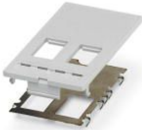
Front plate, plastic with shroud, for 2x RJ with modular system (Keystone)

Please be informed that the data shown in this PDF Document is generated from our Online Catalog. Please find the complete data in the user's documentation. Our General Terms of Use for Downloads are valid ( http://phoenixcontact.com/download )