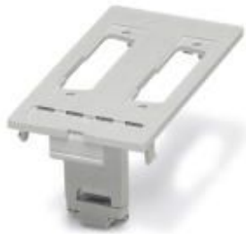
Data front plate, plastic, for 2x D-SUB 25, item 1656961 may be required for mounting D-SUB inserts

Please be informed that the data shown in this PDF Document is generated from our Online Catalog. Please find the complete data in the user's documentation. Our General Terms of Use for Downloads are valid ( http://phoenixcontact.com/download )