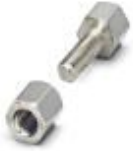
Mounting set, for DSUB gender changer contact inserts