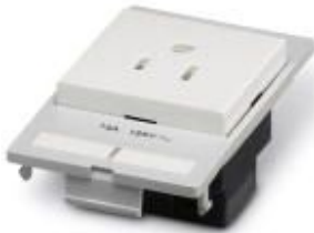
Ground contact socket, plastic, for USA

Please be informed that the data shown in this PDF Document is generated from our Online Catalog. Please find the complete data in the user's documentation. Our General Terms of Use for Downloads are valid ( http://phoenixcontact.com/download )