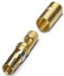
Coaxial contact, for D-SUB combination inserts, solder cup, socket, straight, for cable RG 58, gold-plated

Please be informed that the data shown in this PDF Document is generated from our Online Catalog. Please find the complete data in the user's documentation. Our General Terms of Use for Downloads are valid ( http://phoenixcontact.com/download )