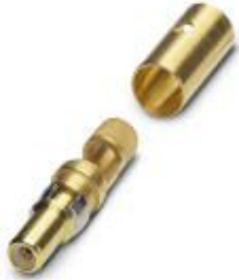
Coaxial contact, for D-SUB combination inserts, solder cup, pin, straight, for cable RG 58, gold-plated

Please be informed that the data shown in this PDF Document is generated from our Online Catalog. Please find the complete data in the user's documentation. Our General Terms of Use for Downloads are valid ( http://phoenixcontact.com/download )