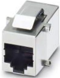
RJ45 socket insert, modular (Keystone), CAT3, 8-pos., shielded, socket on socket

Please be informed that the data shown in this PDF Document is generated from our Online Catalog. Please find the complete data in the user's documentation. Our General Terms of Use for Downloads are valid ( http://phoenixcontact.com/download )