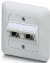
Terminal outlet, flush-type mounting, IP20, two slots for contact inserts with the Freenet system

Please be informed that the data shown in this PDF Document is generated from our Online Catalog. Please find the complete data in the user's documentation. Our General Terms of Use for Downloads are valid ( http://phoenixcontact.com/download )