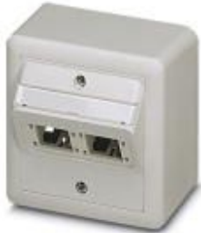
Terminal outlet, surface mounting, IP20, two slots for contact inserts with the Freenet system

Please be informed that the data shown in this PDF Document is generated from our Online Catalog. Please find the complete data in the user's documentation. Our General Terms of Use for Downloads are valid ( http://phoenixcontact.com/download )