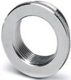
Reducing adapter, material: Brass, nickel-plated, connecting thread: M25 x 1.5, color: silver, with O-ring

Please be informed that the data shown in this PDF Document is generated from our Online Catalog. Please find the complete data in the user's documentation. Our General Terms of Use for Downloads are valid ( http://phoenixcontact.com/download )