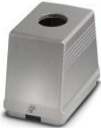
HEAVYCON sleeve housing B48, for single locking latch, height 96 mm, with thread 1x M40, straight conductor exit

Please be informed that the data shown in this PDF Document is generated from our Online Catalog. Please find the complete data in the user's documentation. Our General Terms of Use for Downloads are valid ( http://phoenixcontact.com/download )