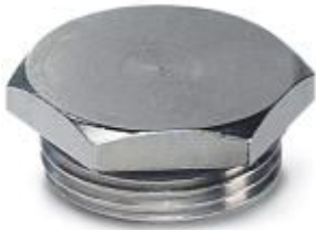
Filler plug, metal, size: M16

Please be informed that the data shown in this PDF Document is generated from our Online Catalog. Please find the complete data in the user's documentation. Our General Terms of Use for Downloads are valid ( http://phoenixcontact.com/download )