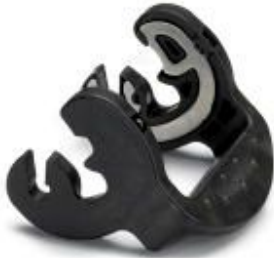
Replacement latch for HC-B10 / HC-B16/ HC-B24 housings with double locking latch (plastic design)

Please be informed that the data shown in this PDF Document is generated from our Online Catalog. Please find the complete data in the user's documentation. Our General Terms of Use for Downloads are valid ( http://phoenixcontact.com/download )