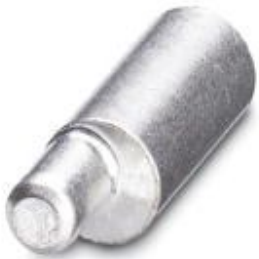
Cable lug for HEAVYCON-MODULAR; PE connection extension to 16 mm 2 , for crimping with crimp pliers

Please be informed that the data shown in this PDF Document is generated from our Online Catalog. Please find the complete data in the user's documentation. Our General Terms of Use for Downloads are valid ( http://phoenixcontact.com/download )