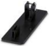
Table bracket for SB-Z0016 crimping pliers for turned crimp contacts with Ø 3.6 mm from the SB series