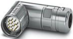
The figure shows the 12-pos. product version with solder contacts

Cable connector, CA, angled, shielded: yes, SPEEDCON locking, M23, No. of pos.: 16+2+PE, type of contact: Pin, Crimp connection, cable diameter range: 10 mm ... 14.5 mm