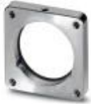
Square mounting flange, Axial seal, 4xM3, flange dimensions: 35 mm x 35 mm

Square mounting flange - RF-Z0003 - 1607905