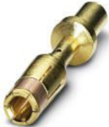
Crimp contact, contact diameter: 3.6 mm, crimp range: 16 mm 2 ... 16 mm 2

Please be informed that the data shown in this PDF Document is generated from our Online Catalog. Please find the complete data in the user's documentation. Our General Terms of Use for Downloads are valid ( http://phoenixcontact.com/download )