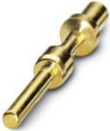
Crimp contact, turned, contact diameter: 3.6 mm, crimp range: 16 mm 2 ... 16 mm 2

Please be informed that the data shown in this PDF Document is generated from our Online Catalog. Please find the complete data in the user's documentation. Our General Terms of Use for Downloads are valid ( http://phoenixcontact.com/download )