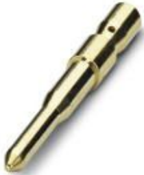
Crimp contact, leading (PE), turned, contact diameter: 1.5 mm, crimp range: 0.5 mm 2 ... 1 mm 2

Please be informed that the data shown in this PDF Document is generated from our Online Catalog. Please find the complete data in the user's documentation. Our General Terms of Use for Downloads are valid ( http://phoenixcontact.com/download )