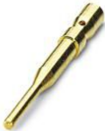
Crimp contact, turned, contact diameter: 1 mm, crimp range: 0.5 mm 2 ... 1 mm 2

Please be informed that the data shown in this PDF Document is generated from our Online Catalog. Please find the complete data in the user's documentation. Our General Terms of Use for Downloads are valid ( http://phoenixcontact.com/download )