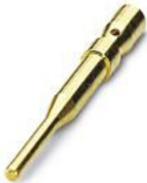
Crimp contact, turned, contact diameter: 1 mm, crimp range: 0.14 mm 2 ... 0.56 mm 2

Please be informed that the data shown in this PDF Document is generated from our Online Catalog. Please find the complete data in the user's documentation. Our General Terms of Use for Downloads are valid ( http://phoenixcontact.com/download )