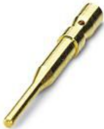
Crimp contact, turned, contact diameter: 1 mm, crimp range: 0.08 mm 2 ... 0.22 mm 2

Please be informed that the data shown in this PDF Document is generated from our Online Catalog. Please find the complete data in the user's documentation. Our General Terms of Use for Downloads are valid ( http://phoenixcontact.com/download )