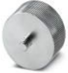
Metal protection cap for M40 connectors with external thread

Metal protective cap - SB-Z0001 - 1623827