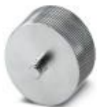
Metal protection cap for M40 connectors with external thread

Metal protective cap - SB-Z0001 - 1623827