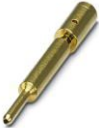
Crimp contact, turned, Single contact, contact diameter: 1 mm, crimp range: 0.5 mm 2 ... 1 mm 2

Please be informed that the data shown in this PDF Document is generated from our Online Catalog. Please find the complete data in the user's documentation. Our General Terms of Use for Downloads are valid ( http://phoenixcontact.com/download )