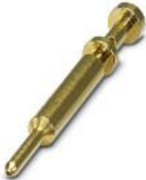
Crimp contact, turned, contact diameter: 1 mm, crimp range: 0.06 mm 2 ... 0.25 mm 2

Please be informed that the data shown in this PDF Document is generated from our Online Catalog. Please find the complete data in the user's documentation. Our General Terms of Use for Downloads are valid ( http://phoenixcontact.com/download )