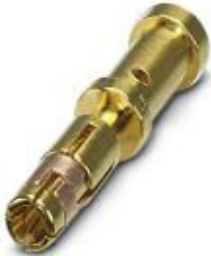
Crimp contact, turned, contact diameter: 1 mm, crimp range: 0.34 mm 2 ... 0.5 mm 2

Please be informed that the data shown in this PDF Document is generated from our Online Catalog. Please find the complete data in the user's documentation. Our General Terms of Use for Downloads are valid ( http://phoenixcontact.com/download )