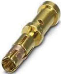
Crimp contact, turned, contact diameter: 1 mm, crimp range: 0.06 mm 2 ... 0.25 mm 2

Please be informed that the data shown in this PDF Document is generated from our Online Catalog. Please find the complete data in the user's documentation. Our General Terms of Use for Downloads are valid ( http://phoenixcontact.com/download )