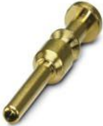
Crimp contact, turned, Single contact, contact diameter: 3.6 mm, crimp range: 4 mm 2 ... 6 mm 2

Please be informed that the data shown in this PDF Document is generated from our Online Catalog. Please find the complete data in the user's documentation. Our General Terms of Use for Downloads are valid ( http://phoenixcontact.com/download )