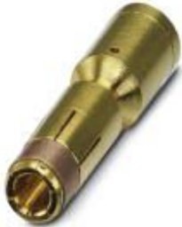
Crimp contact, turned, Single contact, contact diameter: 3.6 mm, crimp range: 16 mm 2 ... 16 mm 2

Please be informed that the data shown in this PDF Document is generated from our Online Catalog. Please find the complete data in the user's documentation. Our General Terms of Use for Downloads are valid ( http://phoenixcontact.com/download )