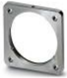
Square mounting flange, 4x Ø4,2

Square mounting flange - SM-Z0004 - 1607937