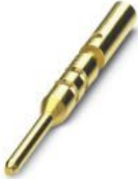
Crimp contact, turned, contact diameter: 0.8 mm, crimp range: 0.34 mm 2 ... 0.5 mm 2

Please be informed that the data shown in this PDF Document is generated from our Online Catalog. Please find the complete data in the user's documentation. Our General Terms of Use for Downloads are valid ( http://phoenixcontact.com/download )