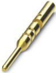
Crimp contact, turned, contact diameter: 0.8 mm, crimp range: 0.08 mm 2 ... 0.25 mm 2

Please be informed that the data shown in this PDF Document is generated from our Online Catalog. Please find the complete data in the user's documentation. Our General Terms of Use for Downloads are valid ( http://phoenixcontact.com/download )