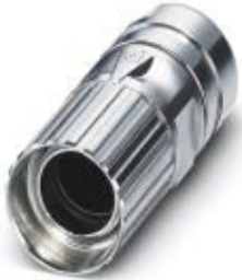
Cable connector, CA, straight, shielded: yes, Screw locking, M23, cable diameter range: 3 mm ... 14.5 mm

Please be informed that the data shown in this PDF Document is generated from our Online Catalog. Please find the complete data in the user's documentation. Our General Terms of Use for Downloads are valid ( http://phoenixcontact.com/download )