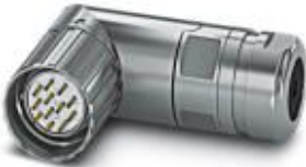
The figure shows the 12-pos. product version with solder contacts

Cable connector, CA, angled, shielded: yes, Screw locking, M23, No. of pos.: 16, type of contact: Pin, Crimp connection, cable diameter range: 3 mm ... 14.5 mm