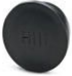
Plastic protection cap, antistatic, for connectors with M23 knurled nut

Plastic anti-static dust protection cap - RC-Z2468 - 1611796