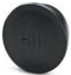
Plastic protection cap, antistatic, for connectors with M23 knurled nut

Plastic anti-static dust protection cap - RC-Z2468 - 1611796