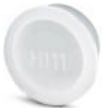
Plastic protection cap for connectors with M23 knurled nut

Plastic anti-static dust protection cap - RC-Z2468 - 1611796