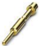
Crimp contact, turned, Single contact, contact diameter: 1 mm, crimp range: 0.06 mm 2 ... 0.25 mm 2